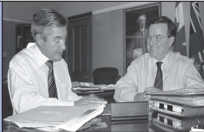
Lee Richardson, MP and Finance Minister Jim Flaherty discuss the budget.

Recently I met with Finance Minister Jim Flaherty to present the results of my consultations with constituents. I would like to thank the several dozen people who took the time to pass along their suggestions, ideas and concerns regarding the upcoming Budget 2011. Their contributions were invaluable to me and in turn the Finance Minister in his preparations. Most suggestions were for minor revisions to the tax system and ideas for spending reductions. The Minister was impressed with many of the ideas and I think it is quite possible more than one could make it through to the final version of the Budget. Thank you