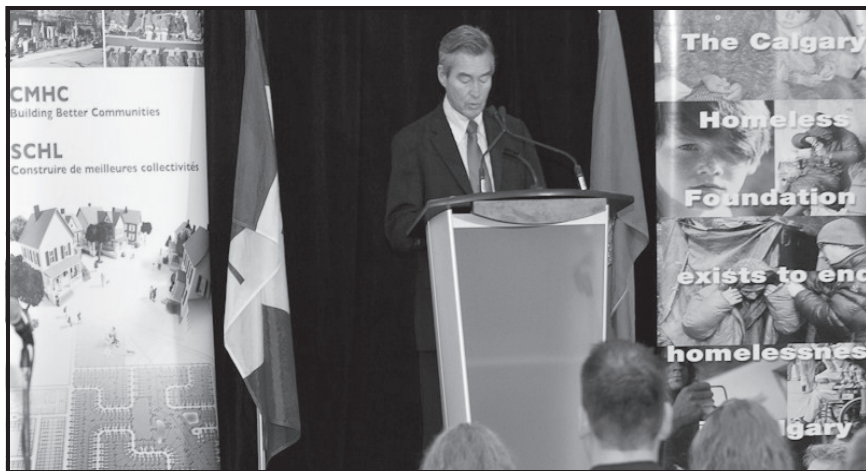
Lee Richardson announces funding to help low-income Calgarians find housing.

The Government of Canada in partnership with the City of Calgary and the Calgary Homeless Foundation (CHF) celebrated the official opening of a 33-unit building for low-income individuals, located in the community of Sunalta, Calgary.