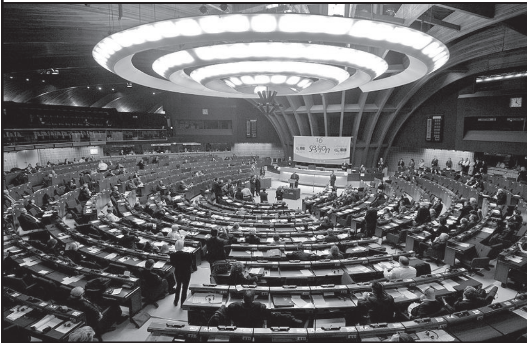
Inside the European Parliament in Strasbourg, Brussels where the 27 member nations of the European Union meet. The 27 countries represent a population of over 500 million people.